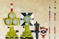
Prisms & Accessories