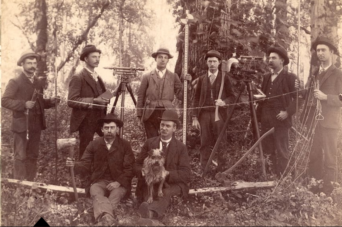
Survey crew in their "Sunday best"; style of clothing dates the image from late 1800s to early 1900s.