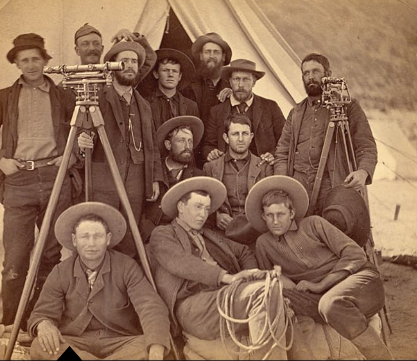
Survey crew in their "Sunday best" at camp.