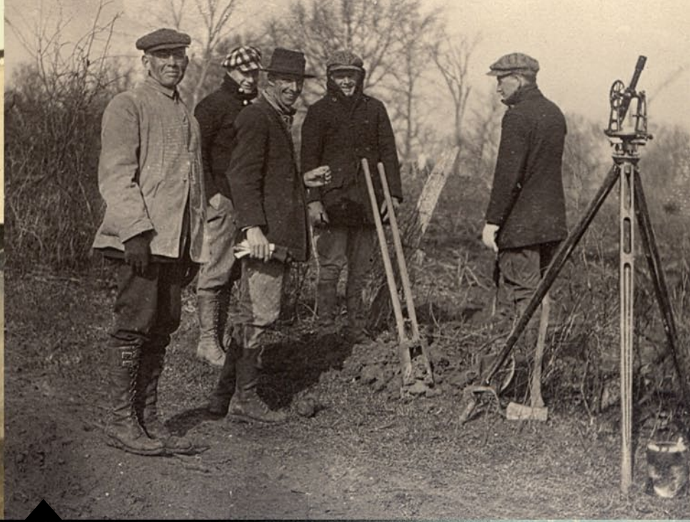
USC&GS crew setting a monument.