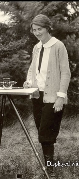
Engineering students and faculty. Thought to be on the campus of the University of Washington, circa 1920.