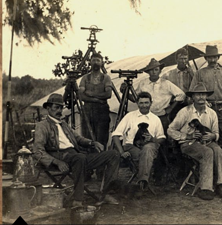
Possibly a USC&GS survey crew at camp.