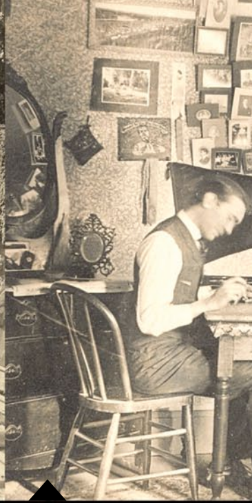
Engineering students at work. The CYK stamp block on the postcard indicates the date to be early 1900s.