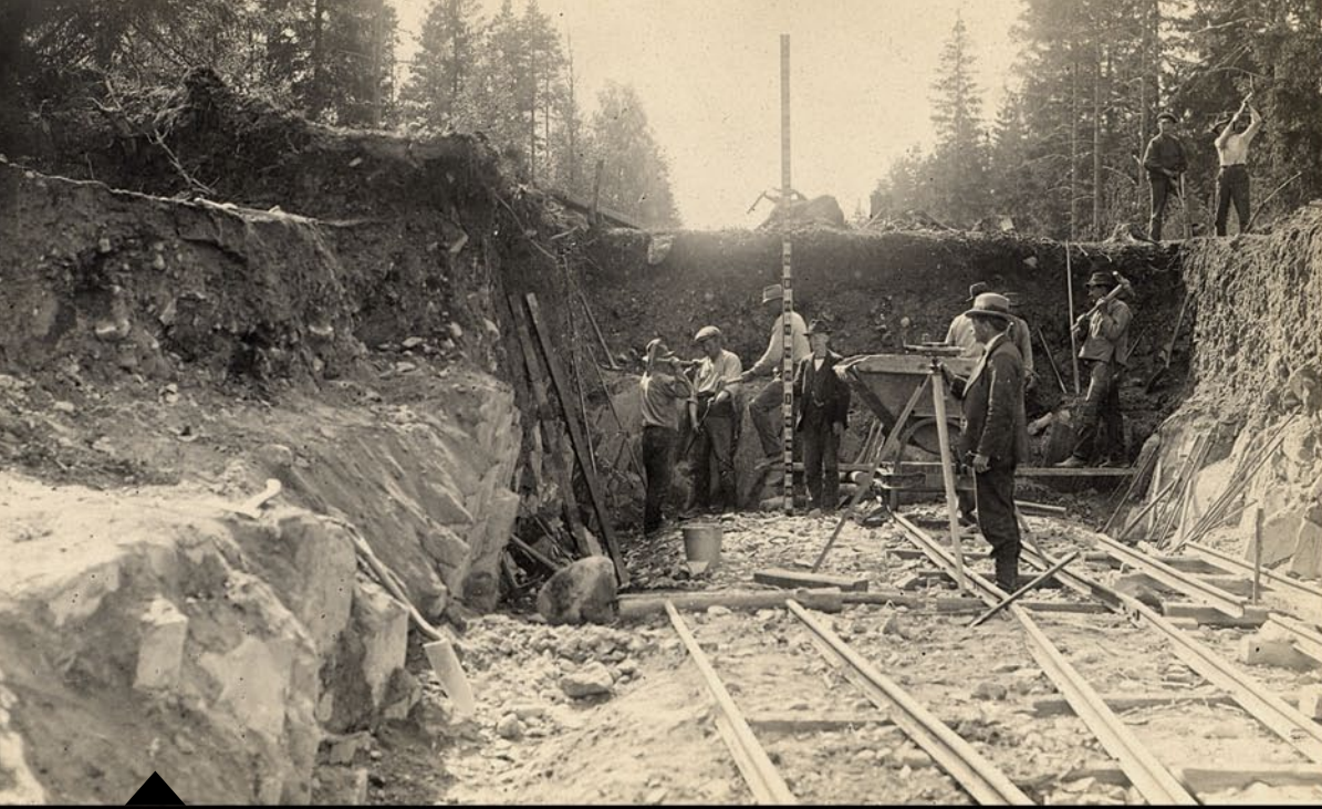
Railroad construction crew.