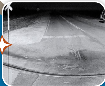
Captured in 7 minutes with the FARO LS 880, this 2D planar view laser scan image of a railroad intersection contains 40 million XYZ coordinate measurements.