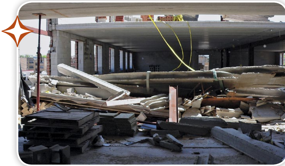
Structural accidents involving high stakes, thousands of artifacts, and difficult access provide opportunities for accident investigators with laser scanners to be heroes.

The control scheme began with a conventional total station network run across the street from, and completely around, the building. Total stations were also used to extend the network into the building, and up to each floor as work progressed.