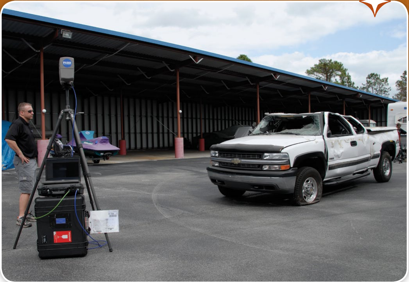
Accident investigators like Gilbert Engineering are typically contracted by law firms to complete their inspections 12 to 18 months after the collisions take place.