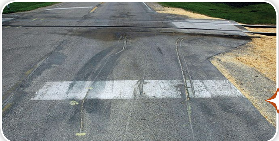
Gouges in the roads and vehicle deformation serve as areas of extreme scrutiny when investigating vehicular accidents.