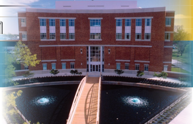
Right: Gornito Center, home of ODU Teletechnet in Norfolk, Virginia

I really wasn't “missing” anything; I was just hungry for something more. That “something” was knowledge. And I was about to feed that hunger.