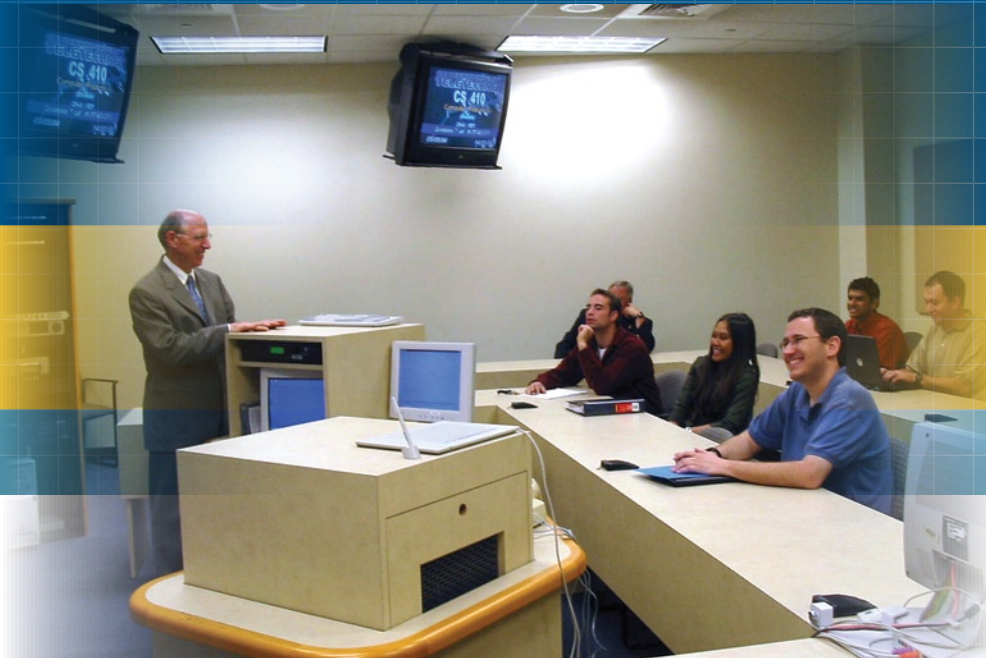
Students at a remote site prepare for class while a local site advisor checks equipment.

Dad, scheduling study time becomes second nature. When our kids see my wife and I study, it also sets a good example for them and their own study habits.